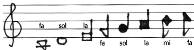
C major scale, written to show how the shapes appear in whole, half, quarter, and eighth notes.

Before singing the words to a Sacred Harp tune, we “sing the notes” by singing the syllables of the shapes.